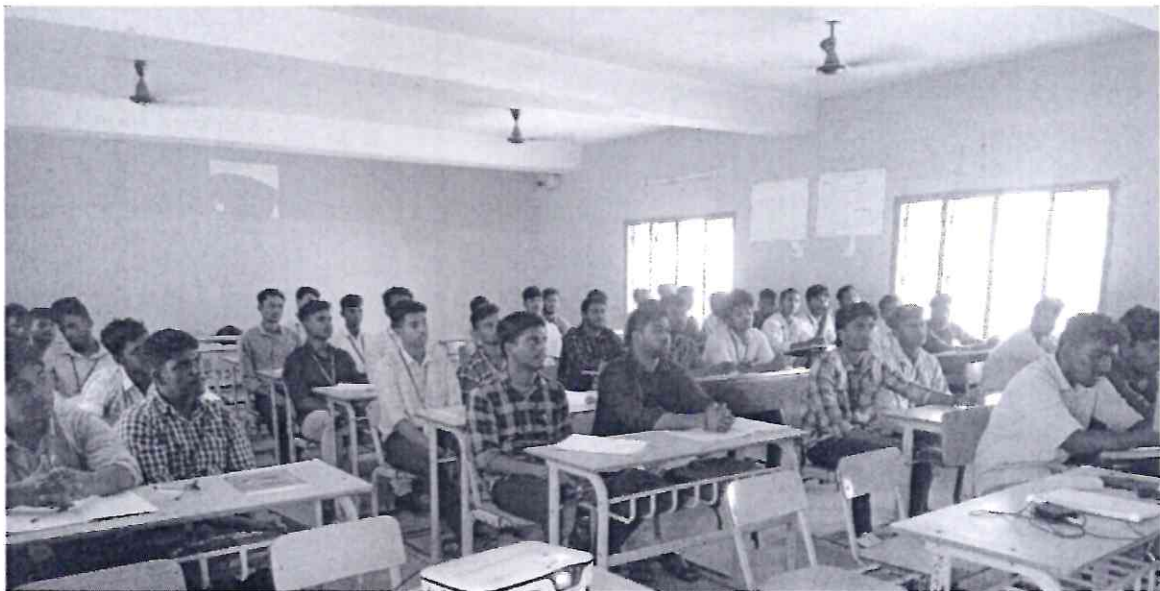
Voter Awareness Campaign held at Chellangkuppam