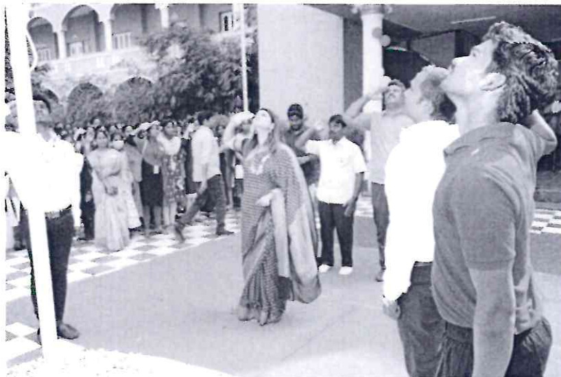
Republic Day celebrations at CKCET Campus, Cuddalore